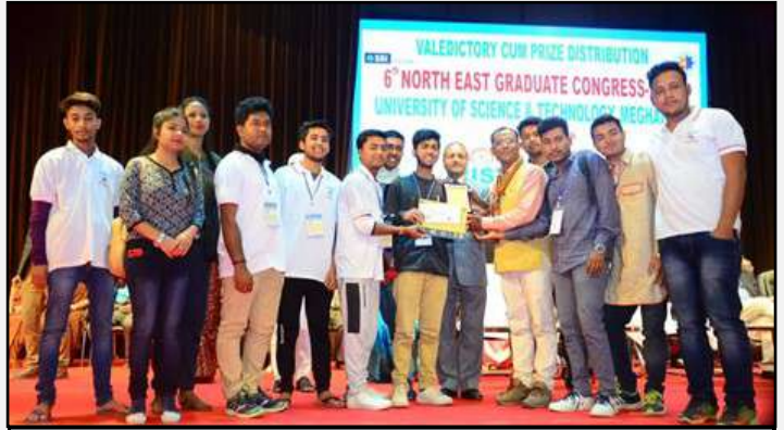
Receiving the First prize in the cultural rally