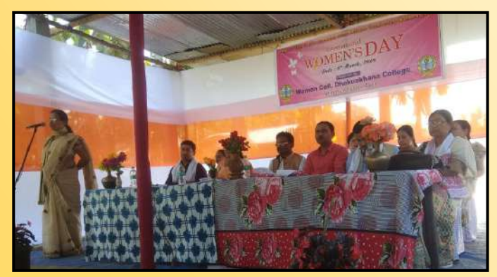
Observance of International Women's Day, 2018 at Kalakata Village, organized by Women Cell, Dhakuakhana College