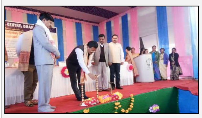
The Inaugural Speech and Lightning of Lamp of a three-month training programme for the state civil services examinations (from 3^{rd} March, 2019 to 1^{st} June, 2019) has been done by Shri Naba Kumar Doley, Honourable Minister of PNRD and Cultural Affairs, Government of Assam.