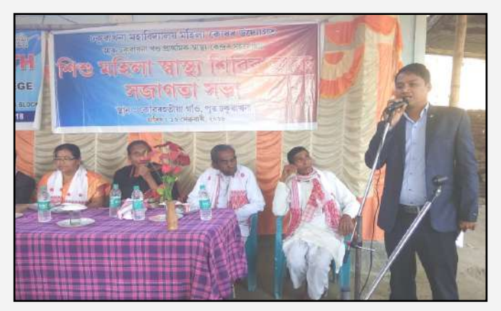
A Moment of health Camp at Konwarhatia Village on 16 Feb, 2018 organized by Women's Cell, DKC