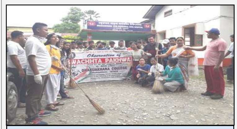
Snapshot from Swachhta Pakhwada, a cleanliness drive